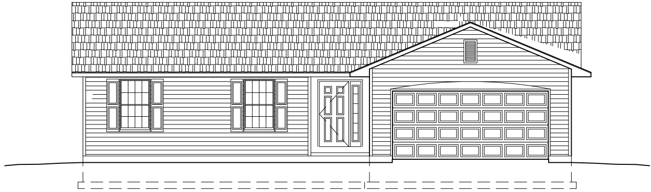
FRONT ELEVATION A-1